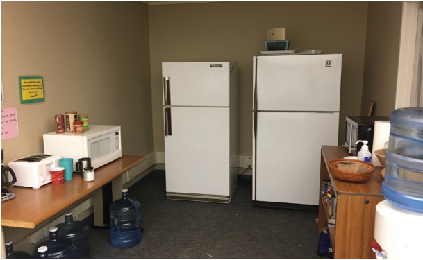
Staff Work Room / Lounge