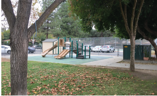
Kindergarten Play Structure