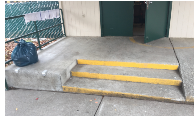
Ramps / Stairs