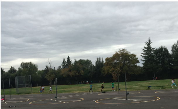
Playfields / Athletics